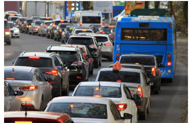
Sustainable Shaftesbury Vision Statement and Masterplan

ensure that everyone involved in the operation of STC (including contractors) are aware of their environmental.